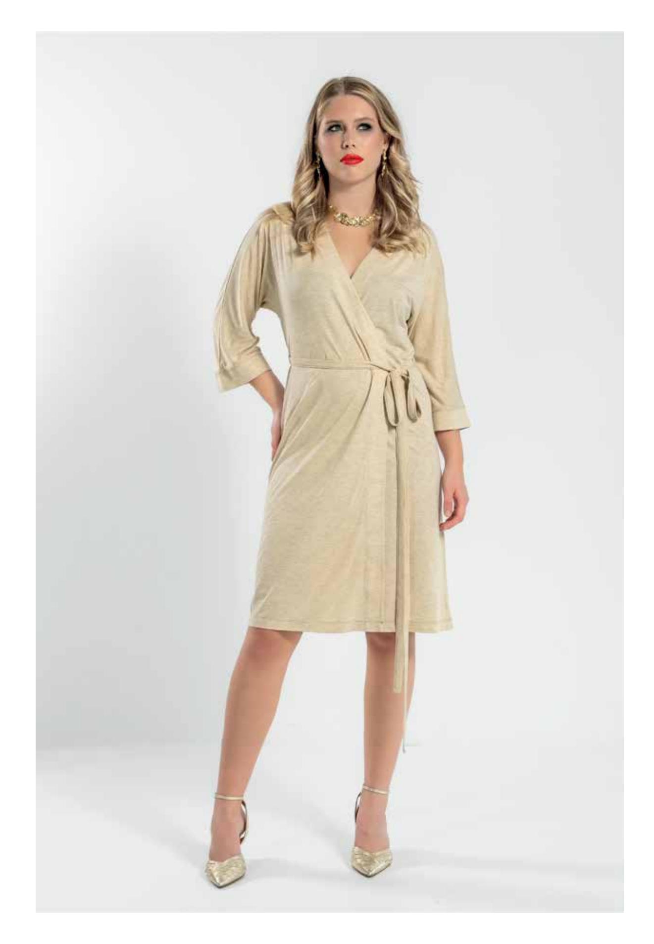
SENSETAX LOOKBOOK 24'