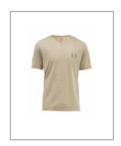
BENJAMIN T-SHIRT FTW-VN1-B-1003