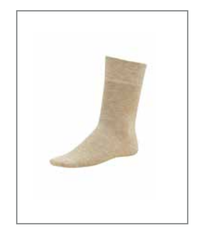
ALPHIE- SOCK MEN FTM-A-1013