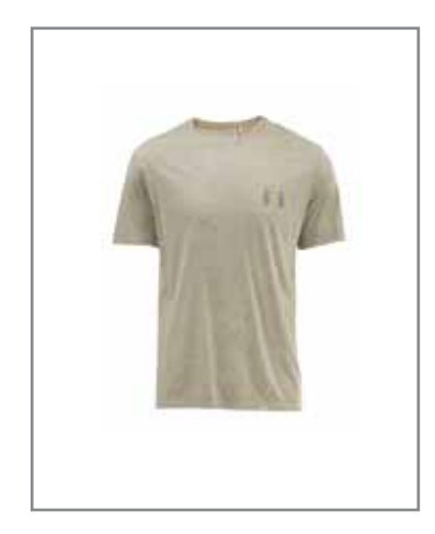
ADAM T-SHIRT FTW-RN1-A-1001