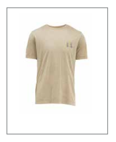
BERT T-SHIRT FTW-RN1-B-1004