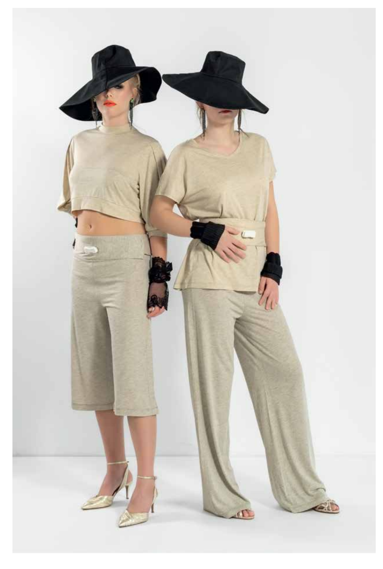
SENSETAX LOOKBOOK 24'