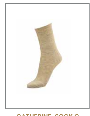
CATHERINE-SOCK C FTW-C-1015