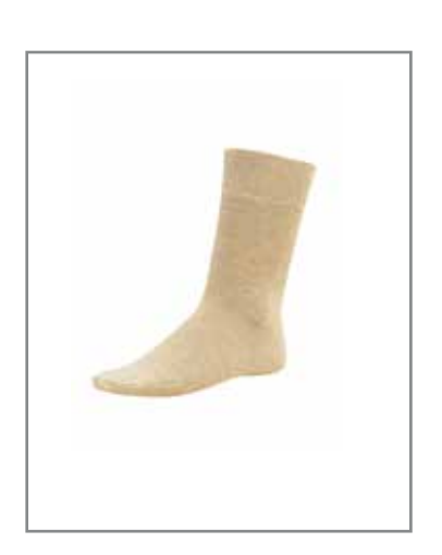
CHRISTOPHER-SOCK MEN FTM-C-1015