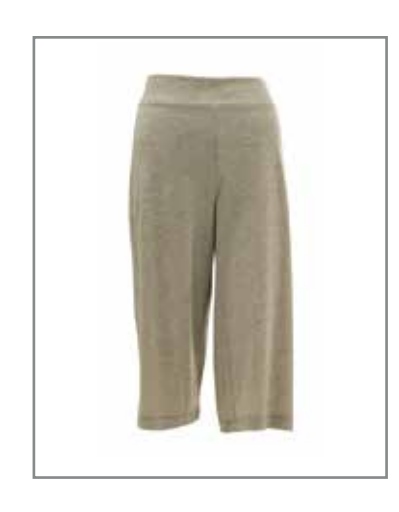
PIA PANTS FTH-5393-A-1021