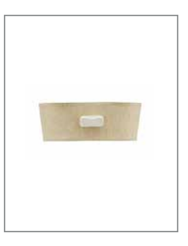
BILLA BELT FTH-5398-C-1020