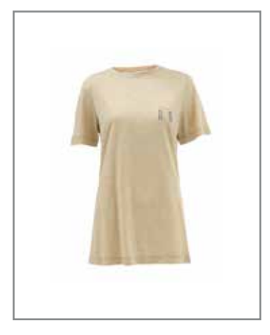
CORNELIA T-SHIRT FTW-VN1-C-1012