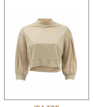
IDA TOP FTH-5392-B-1019