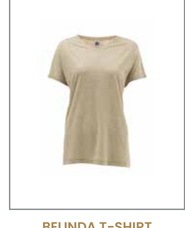
BELINDA T-SHIRT FTW-VN1-B-1009