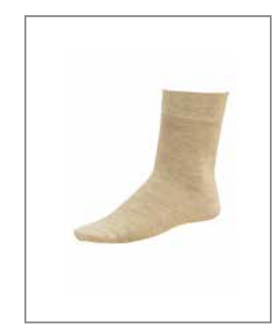
BO-SOCK MEN FTM-B-1014