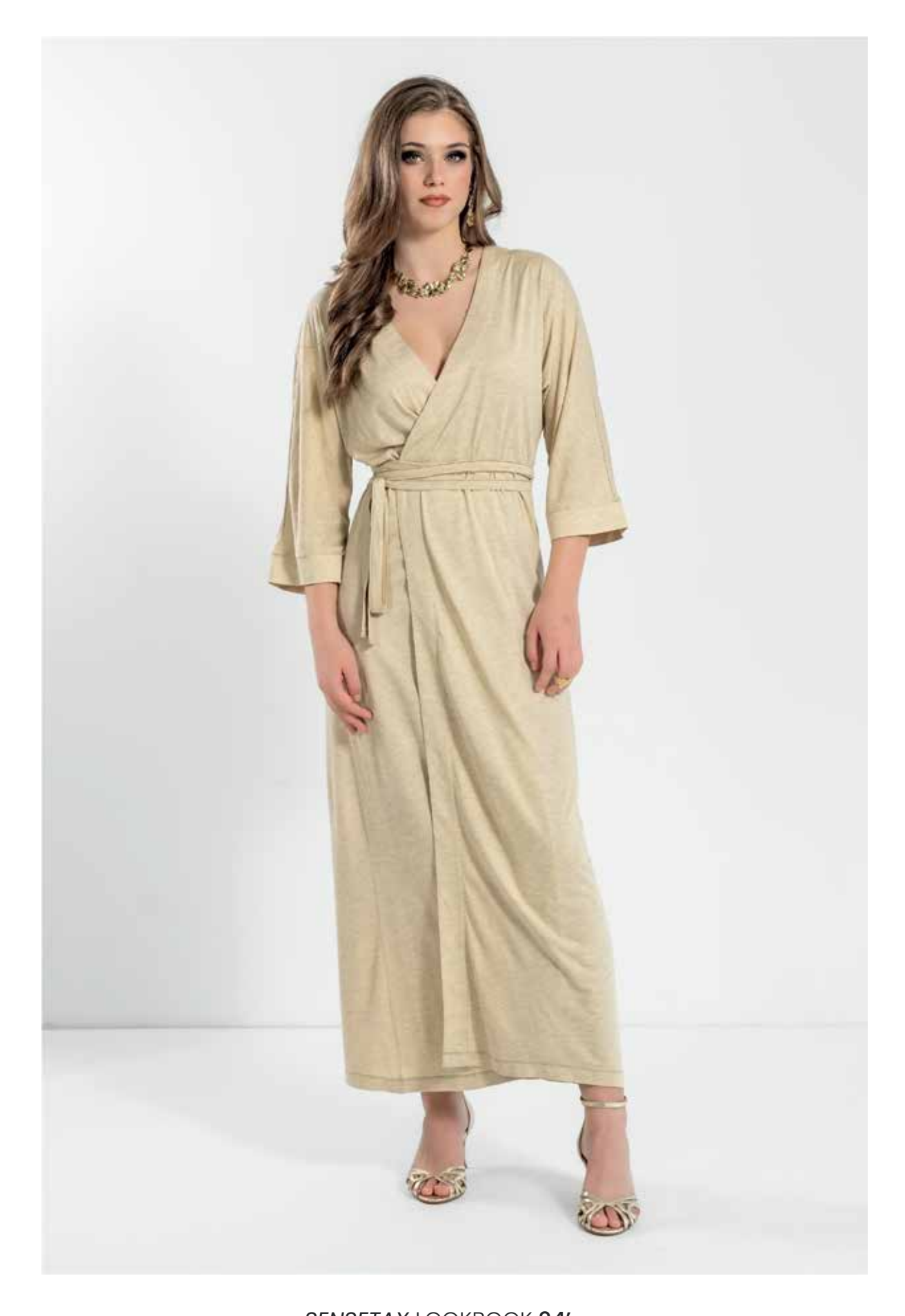
SENSETAX LOOKBOOK 24'