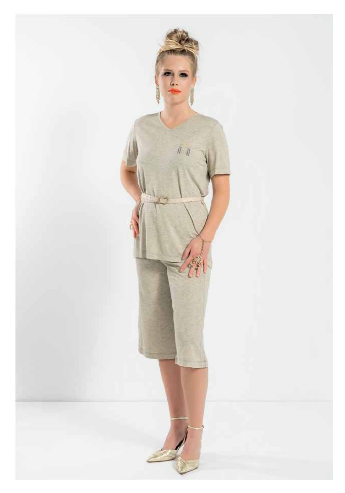
SENSETAX LOOKBOOK 24'