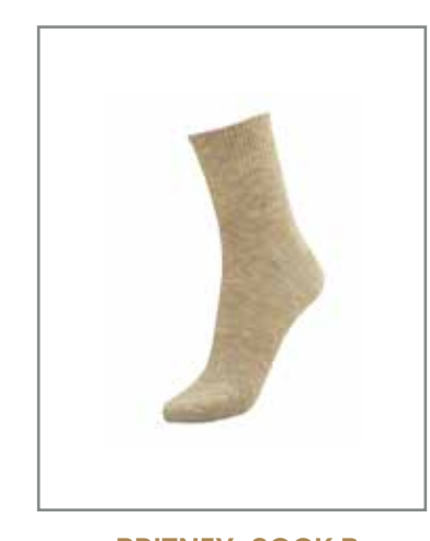
BRITNEY-SOCK B FTW-B-1014