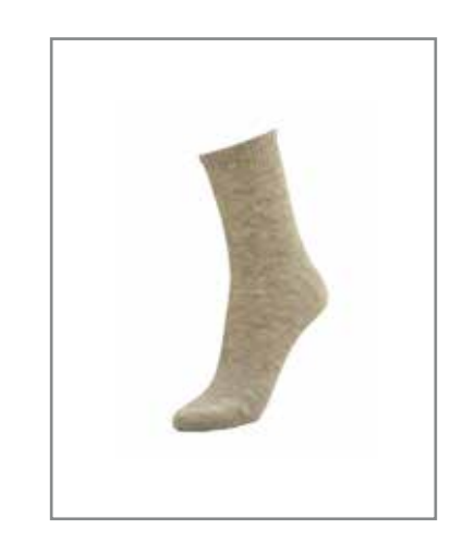
ALINE -SOCK A FTW-A-1013