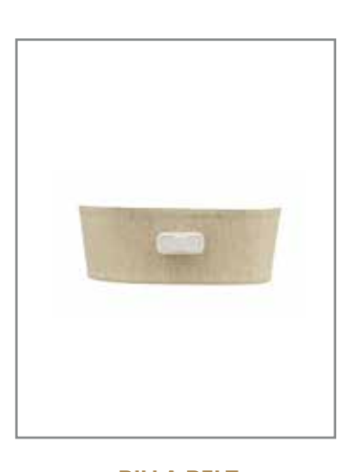
BILLA BELT FTH-5398-B-1019