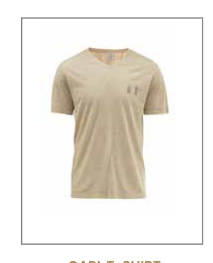
CARL T-SHIRT FTW-VN1-C-1005