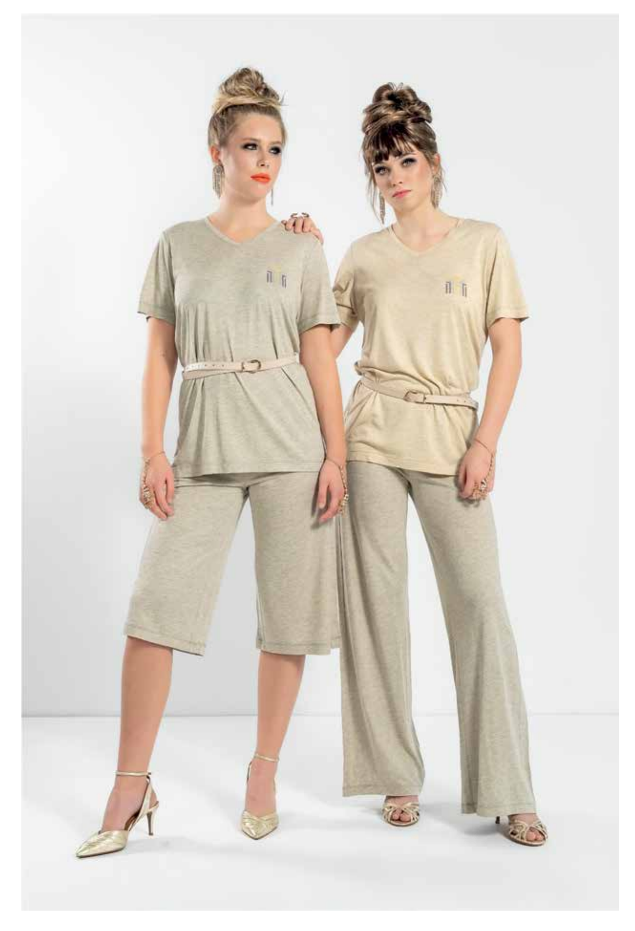
SENSETAX LOOKBOOK 24'