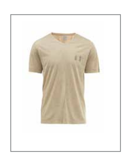
CHRIS T-SHIRT FTM-RN1-C-1006