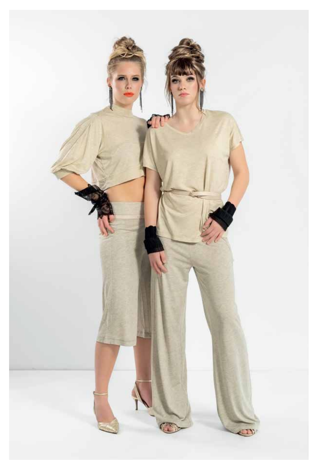
SENSETAX LOOKBOOK 24'