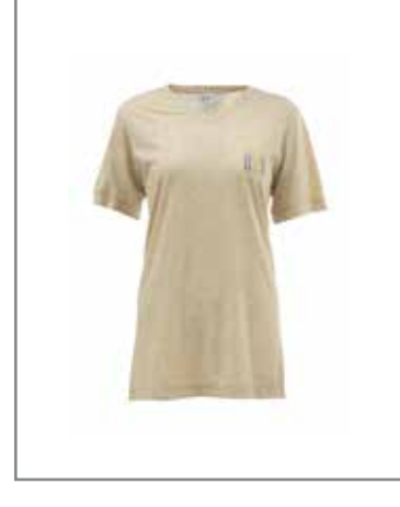
CAROLINE T-SHIRT FTW-VN1-C-1011