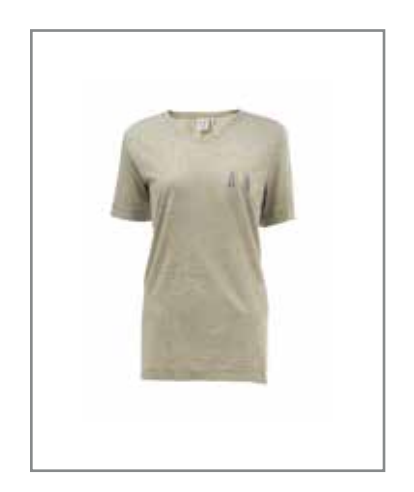
ANNA T-SHIRT FTW-VN1-A-1007