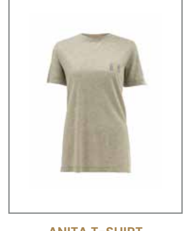
ANITA T-SHIRT FTW-RN1-A-1008