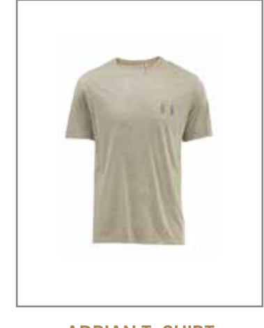
ADRIAN T-SHIRT FTW-VN1-A-1002