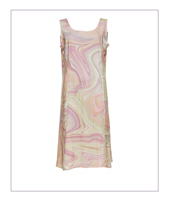
OLGA DRESS SS231012