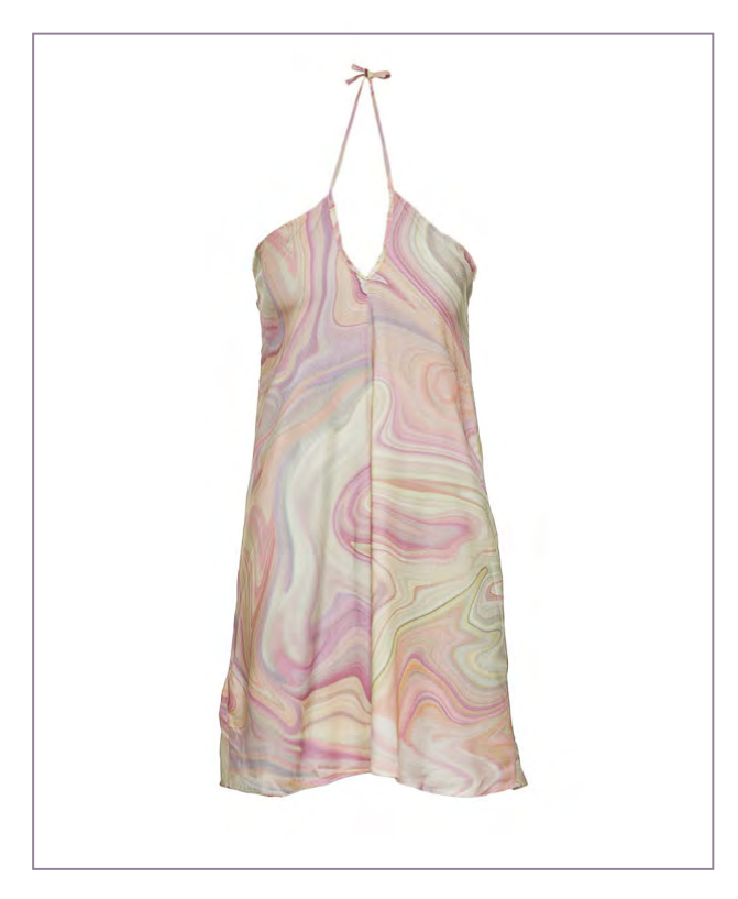
MONIKA DRESS SS231014