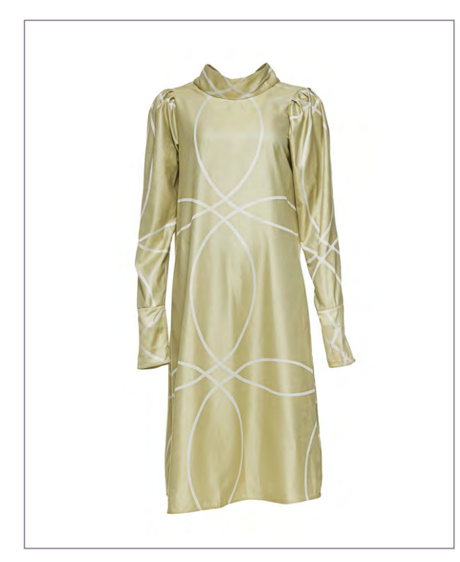
EMINA DRESS SS231007