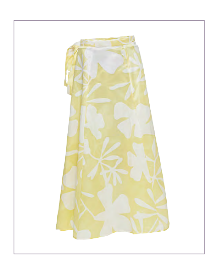
BERIT DRESS SS231015