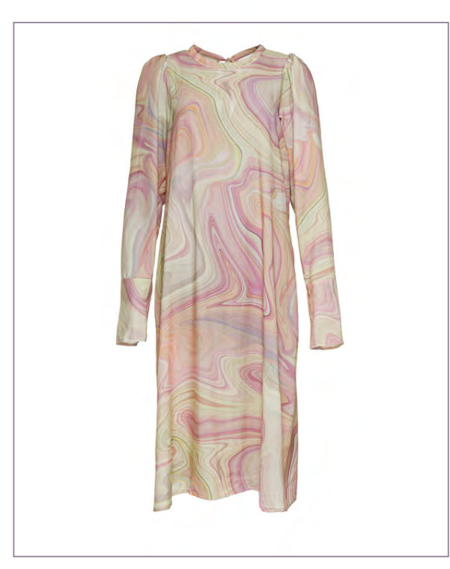
DAGMAR DRESS SS231013