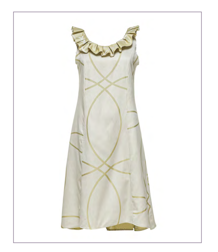
ALICE DRESS SS231010CE