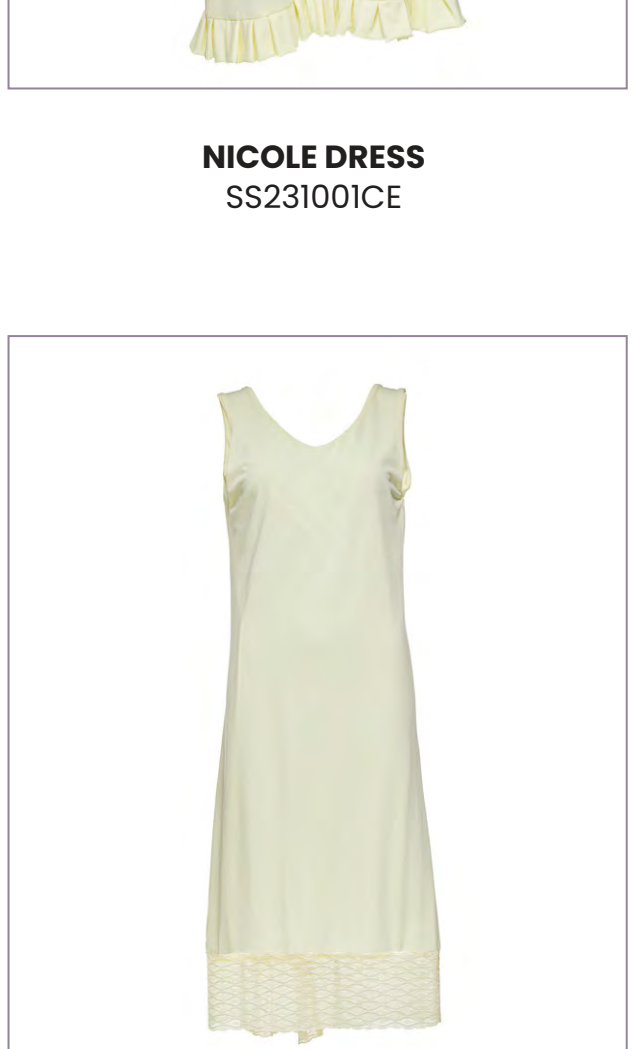
LACEY DRESS SS231003