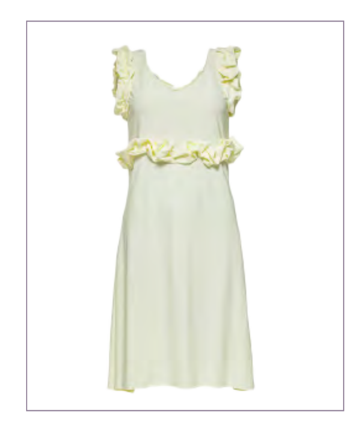
GRETA DRESS SS231006