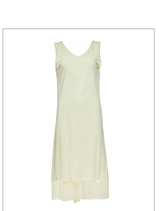
VALERIE DRESS SS231002