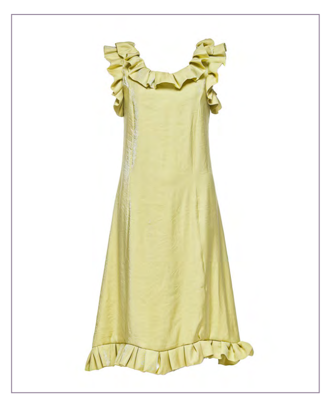
OLIVE DRESS SS231009