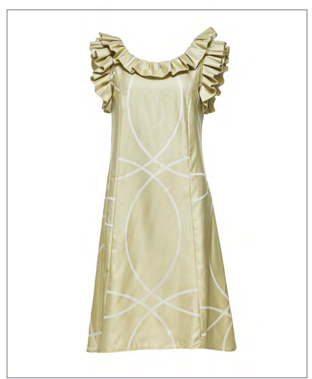
ALICIA DRESS SS231011