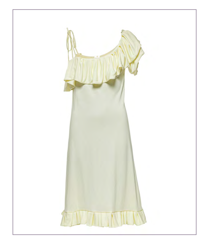
MICHELLE DRESS SS231000