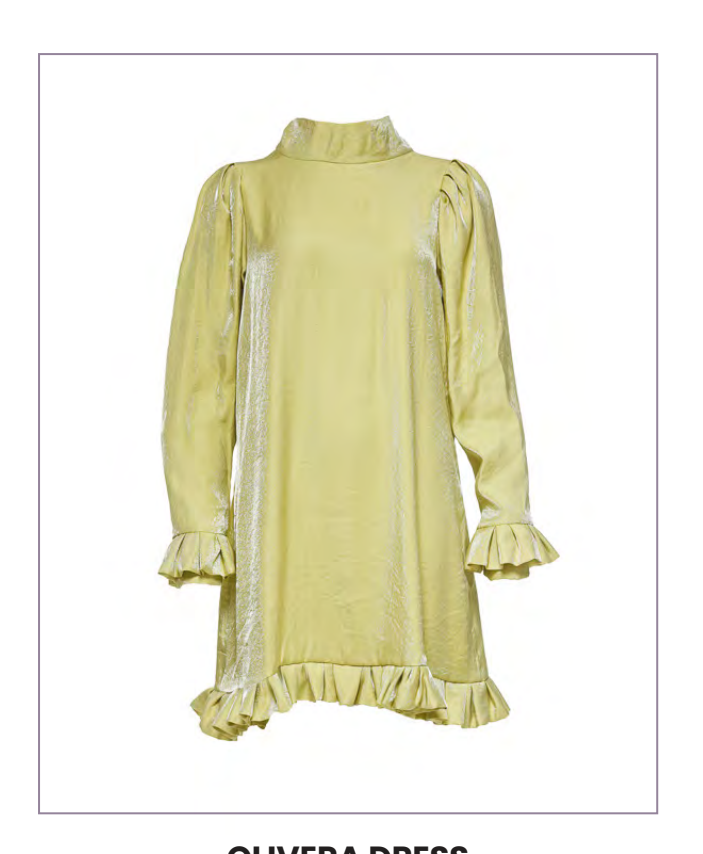
OLIVERA DRESS SS231008